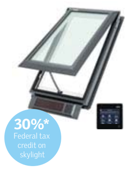
Deck-mounted - Model VSS Curb-mounted - Model VCS